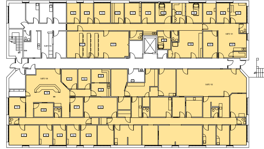
2 NCMT PROFESSIONAL BUILDING (BUILDING 911) - FIRST LEVEL SCALE: 1/16" = 1'-0" (D SIZE)