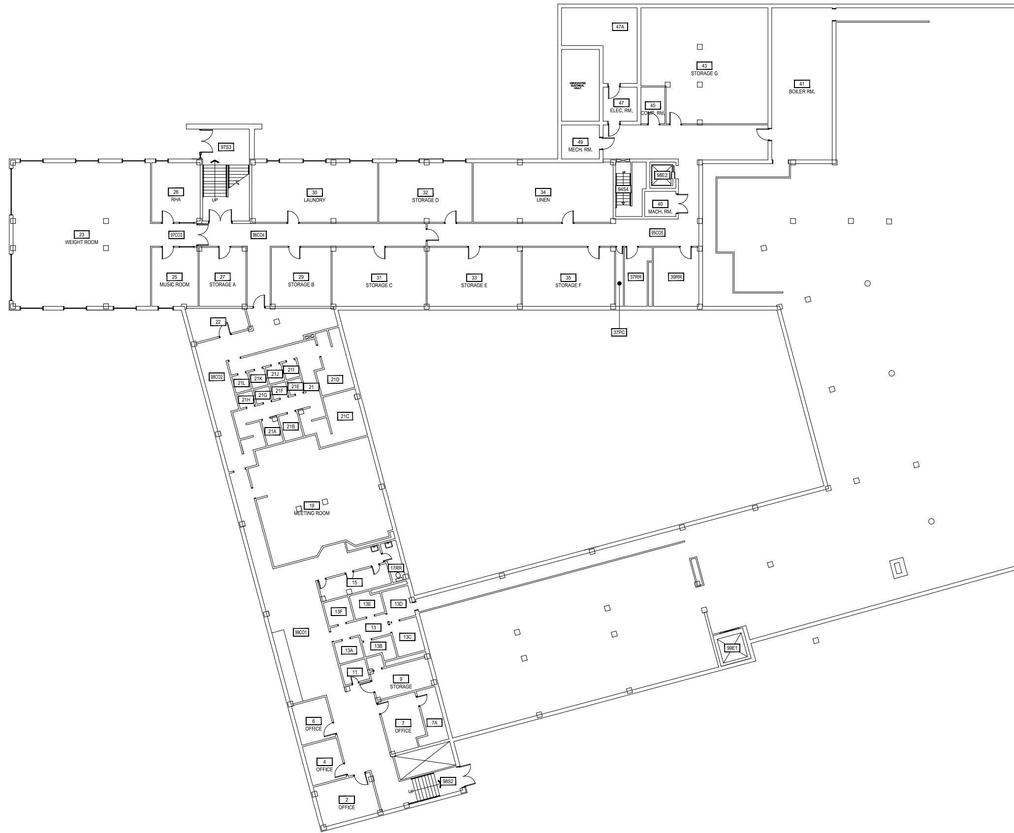
1 HANNON HALL - BASEMENT LEVEL SCALE: 1' = 25'

Dec 15, 2016 - 3:47 pm - 331_AB.dwg H:\Hannon Hall\Building Plan - Book Copy\