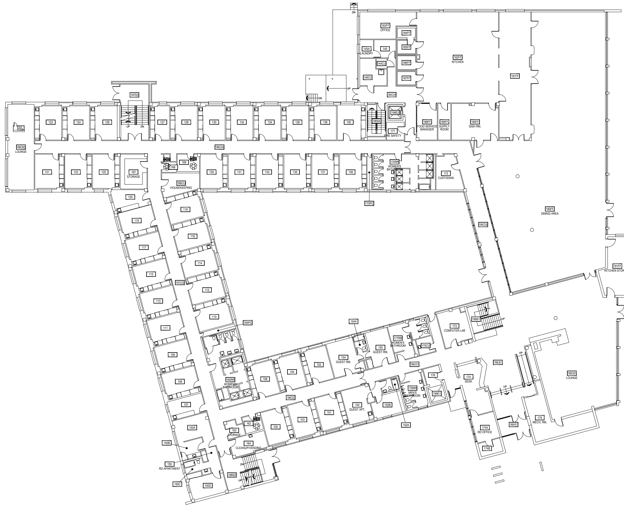
1 HANNON HALL - FIRST LEVEL SCALE: 1' = 25'