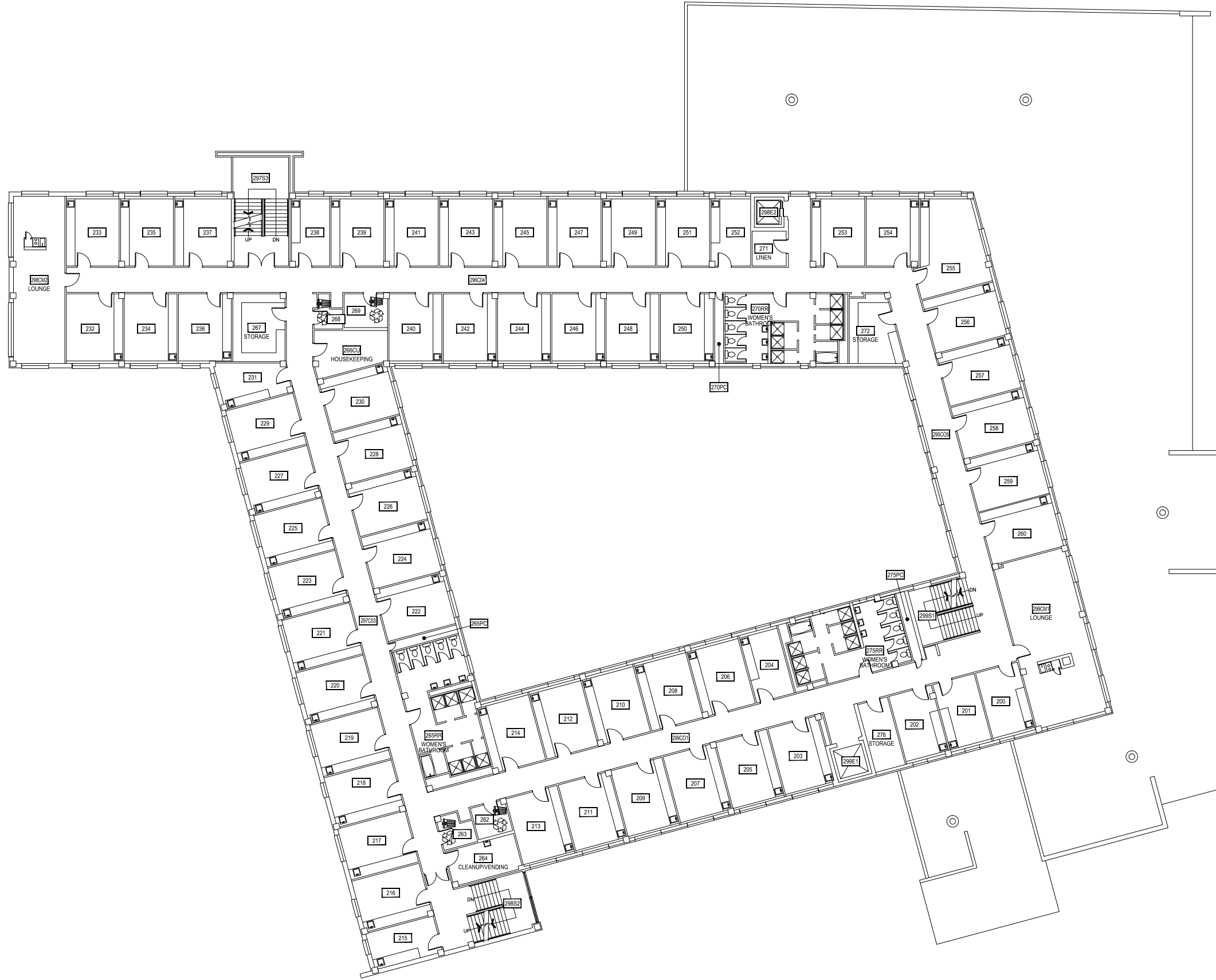
1 HANNON HALL - SECOND LEVEL SCALE: 1' = 25'