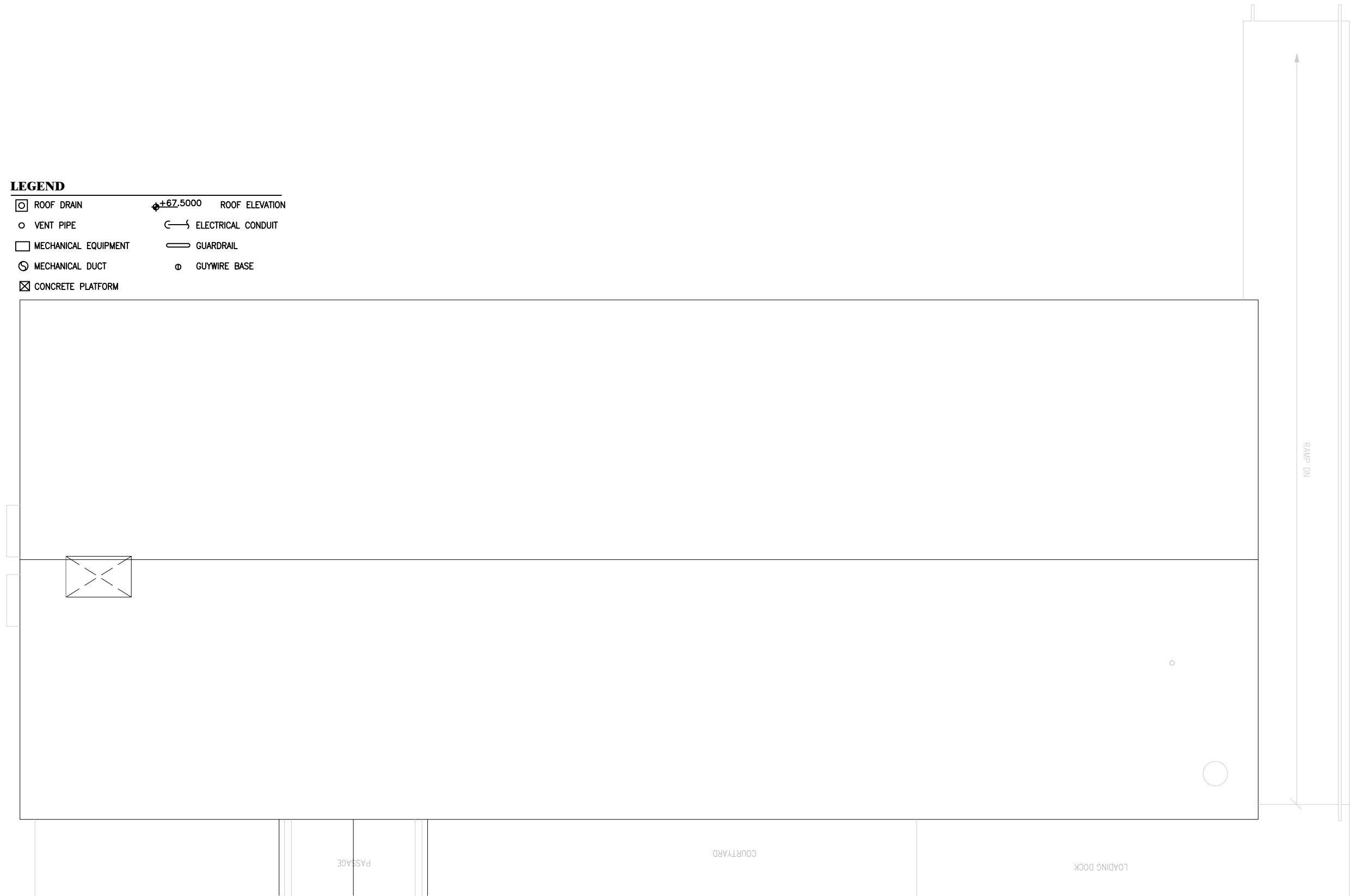
1 FACULTY COURT-11 - ROOF LEVEL SCALE: 5/32" = 1'