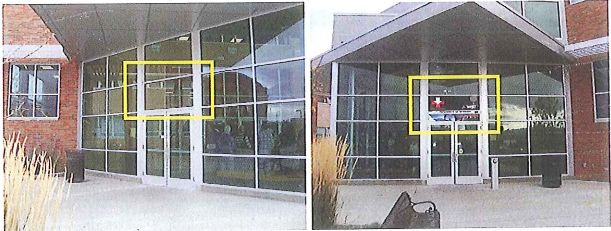
SUB, South Atrium Entry, Two Signs