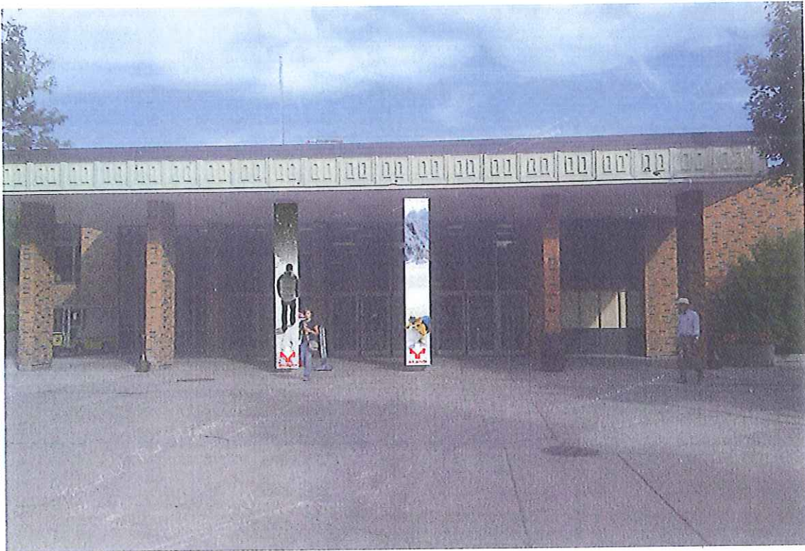
SUB, West Side Location, Entry Portico, Two Banners