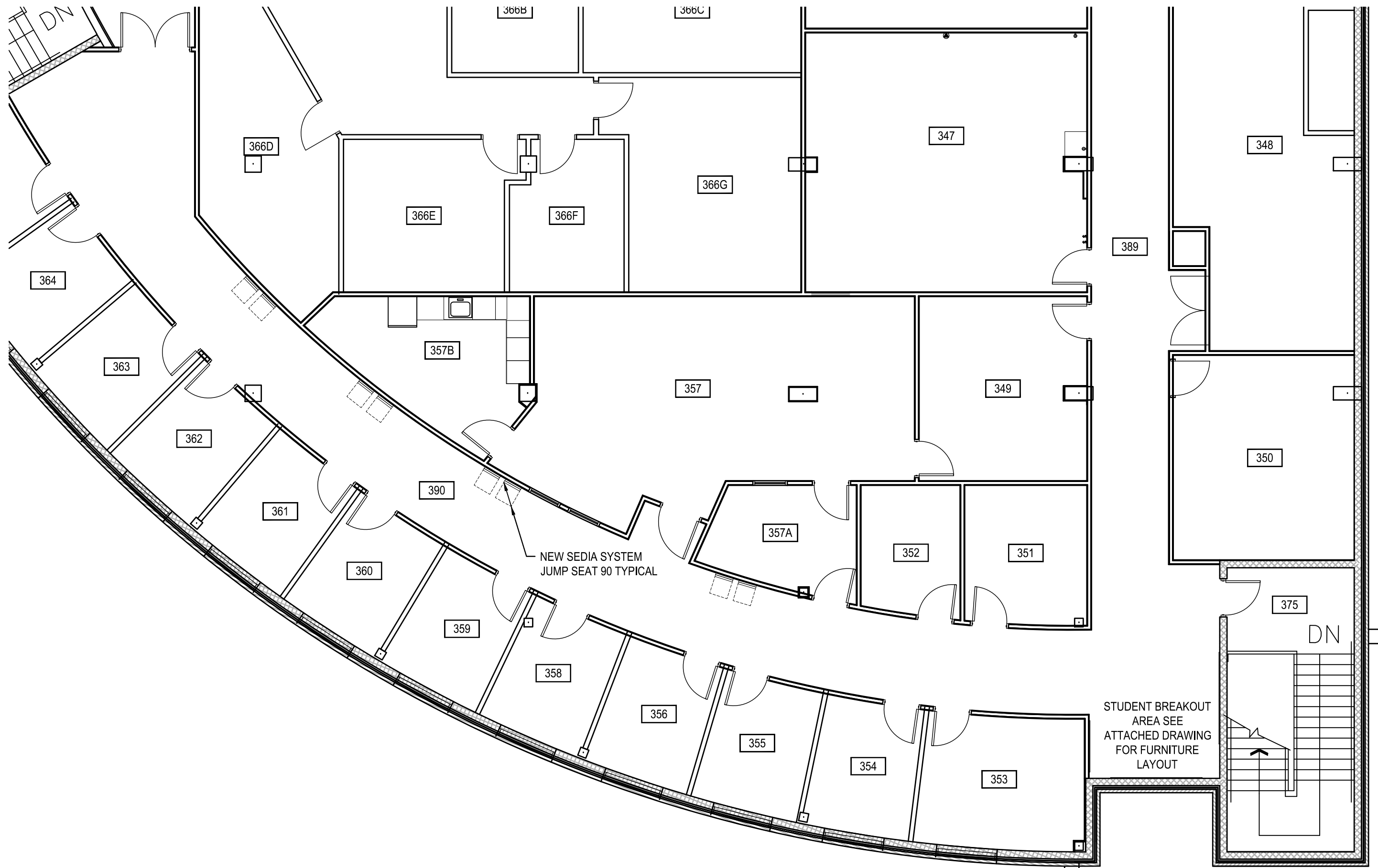
1 NEW FLOORPLAN 1/8" = 1'-0"