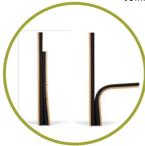
JUMPSEAT 90 | SIDE PROFILE