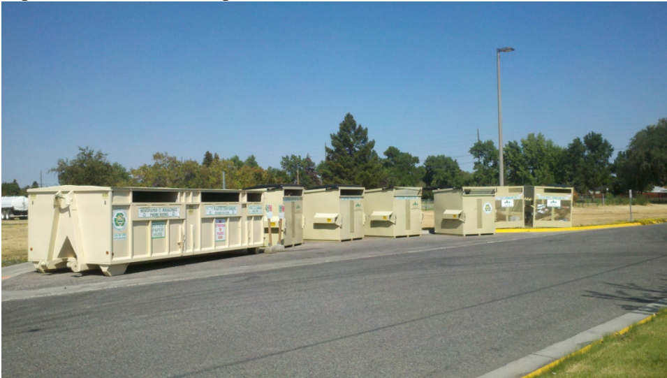
Existing site looking NW with additional dumpsters added on turf to north to meet need.

The work at the Langford dorm made it necessary to remove the Gallatin County Recycling Center located at the far west end of Harrison Street. Users were directed to the other Recycling Center on 13 th . It has been suggested, and the concept is currently being explored, to punch Harrison through to 11 th . If and when this occurs it would preclude positioning a Recycling Center in this area of campus. As part of the Monopoly House demolition and site restoration project there is an opportunity to expand the existing Recycling Center site (13 th Street) and establishing a single site with the capacity to continue to meet campus and community needs. To accomplish this, the capacity of the site would likely need to be doubled. Part of the proposed expansion area is already slated for improvement as part of the Monopoly House project. To be clear, MSU is under no obligation to provide a site for community recycling, but has done so historically. The proposed expansion would meet community needs, address the Harrison Street punch through, and has the potential to dovetail with current project work. This use of the site does not preclude future development as forecast in the LRCDP.