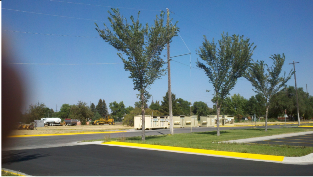
Existing site looking NW including potential expansion area.