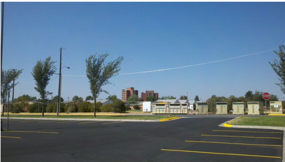
Existing site looking west. Proposed area of expansion to left (south) of existing site.