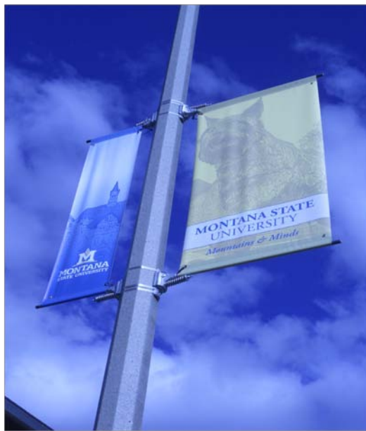
Examples of current banners

The replacement banners will use a bolder blue and gold color palette and an uncomplicated message consisting of the university's logo and tagline (as shown below) instead of the current variety of six different designs. The use of a single design will provide a striking repetition of a bolder announcement of the university.