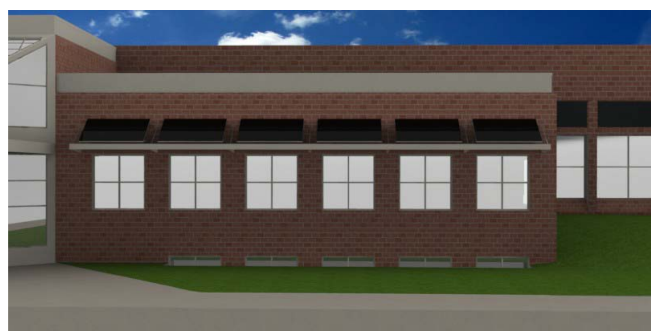
Final design 2 of 2