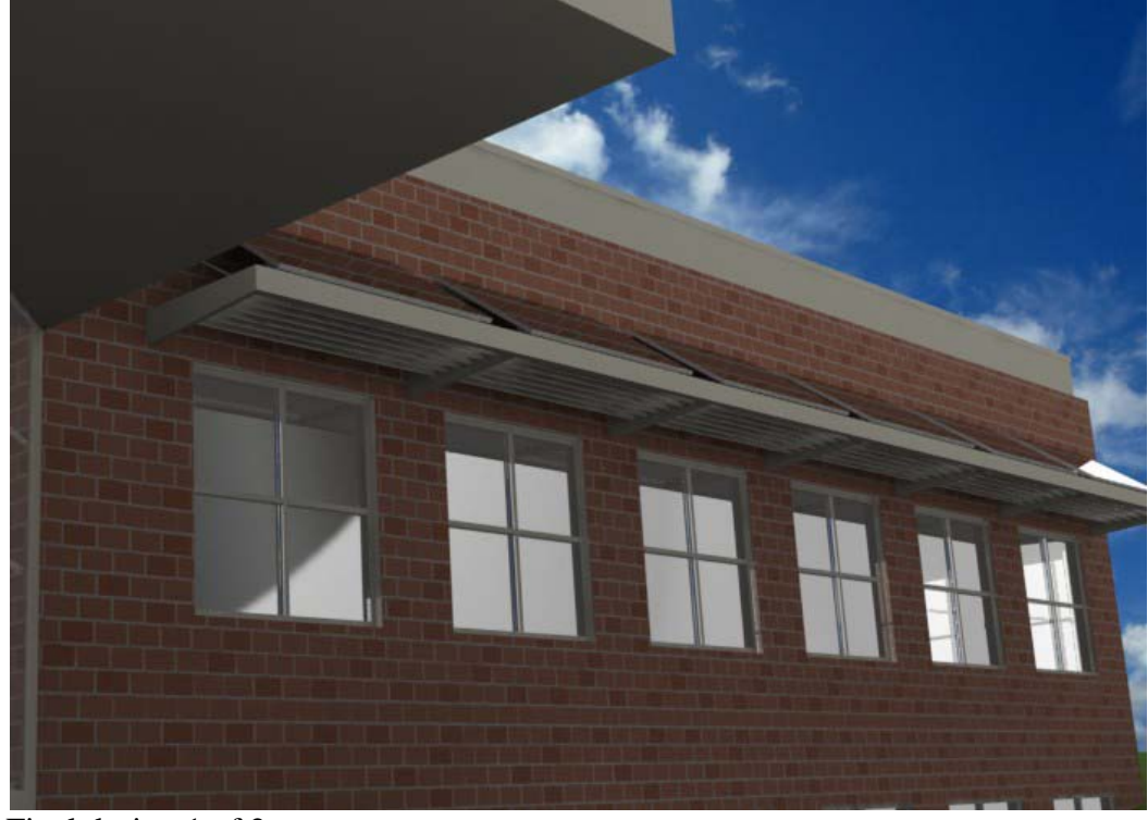
Final design 1 of 2

On April 13, 2010 UFPB approved a recommendation in favor of the Strand Union Building solar panels project in concept but asked that the design be modified to better incorporate the panels into the buildings' architecture; and on May 6, 2010 President Cruzado approved the concept (below). The first two drawing depict the improved final design; and the third drawing is the original drawing used in the concept approval. The final design has been approved by ASMSU, the University Architect and Auxiliaries Services/SUB.